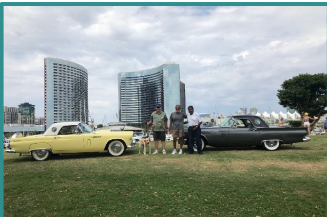
A gorgeous day at Main Street America Car Show along San Diego Bay.

Please watch for emails of added events or changes